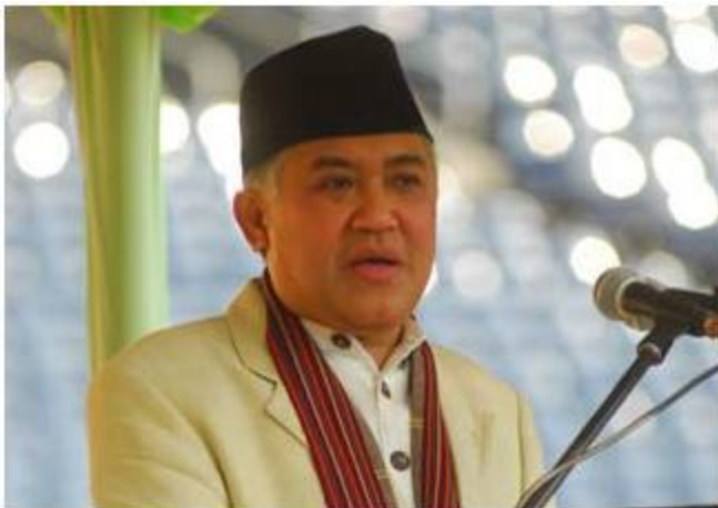
Dr. Din Syamsuddin

RfP is committed to mobilizing the great resources of our respective religious traditions to take action together to help overcome intolerance and violence.