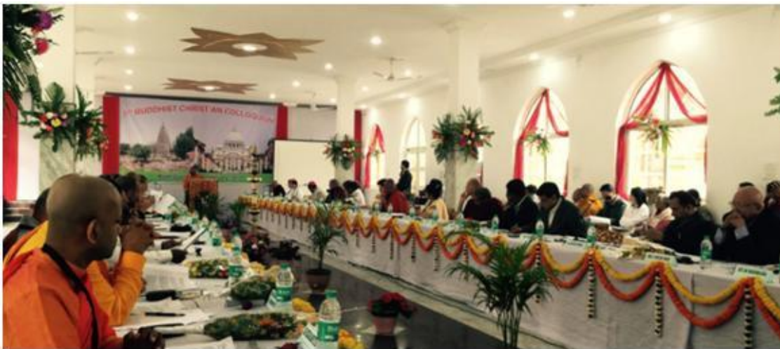
Buddhist and Catholic religious leaders discussing strategies for promoting inter-religious cooperation Bodhgaya

The 5th Buddhist Christian Colloquium at Bodhgaya, India, the sacred site of Buddha's enlightenment, demonstrated that when religious communities recognize their shared values, mobilize their collective assets, and work together, they can have a decisive impact that benefits the greater society.