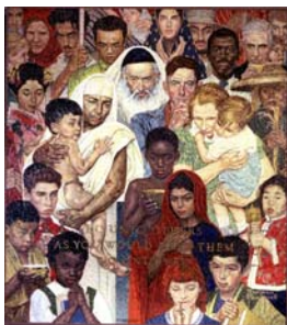
The Committee of Religious NGOs at the United Nations