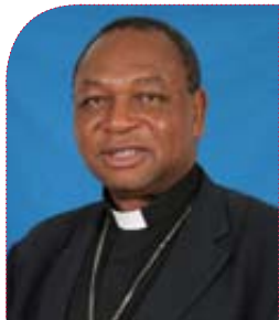
His Grace Archbishop Dr. John Onaiyekan