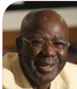
H.E. Dr. Ahmed Tejan Kabbah