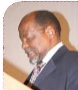
H.E. Joachim Chissano