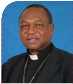
His Grace Arch. Dr. John Onaiyekan

His Grace Arch. Dr. John Onaiyekan , the Co-chair of ACRL– Religions for Peace called for continued and synergised partnership as the best mechanism for addressing conflict and insecurity in the continent. He defined violence as both the use and misuse of force deliberately inflicted on people as well as the unjust oppression reflected by various structures of poverty in human society.