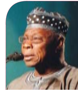
H.E. Olusegun Obasanjo