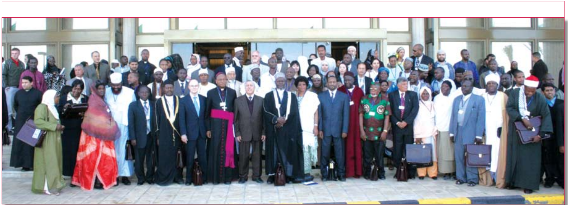
Delegates to the ACRL– Religions for Peace 2 nd General Assembly, Tripoli Libya