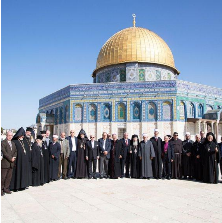
The Heads of Churches in Jerusalem visited the Grand Mufti and the Islamic Waqf to show solidarity between the two religions and to endorse the historic Status Quo of the Holy Sites in Jerusalem.