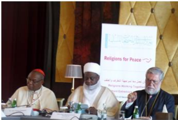
(L-R: Cardinal John Onaiyekan, the Sultan of Sokoto and His Holiness Aram I)

"The bible has been in existence for thousands of years but every generation has interpreted the bible to reflect the needs of their generation; we are not scandalized when the interpretations of 6th century are different from today. We need to interpret for today, for our own people," said Cardinal Onaiyekan .