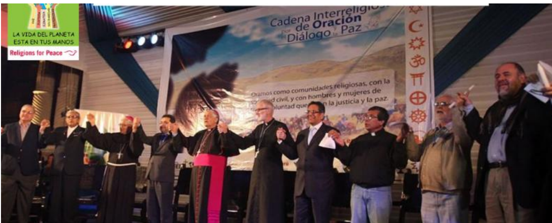
The recent World Assembly of Religions for Peace called on religious leaders and people of faith